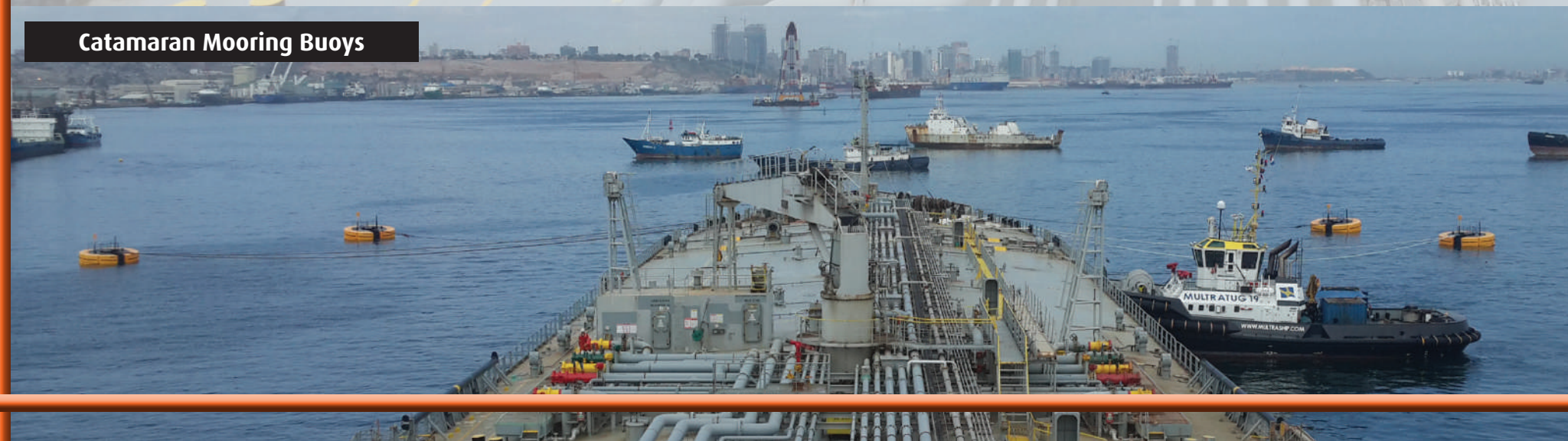
Catamaran Mooring Buoys