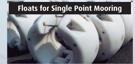
Floats for Single Point Mooring