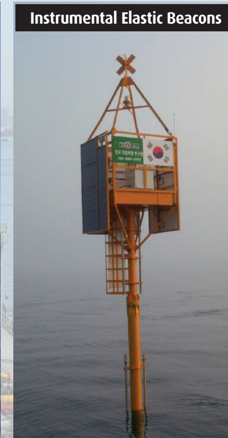
Instrumental Elastic Beacons