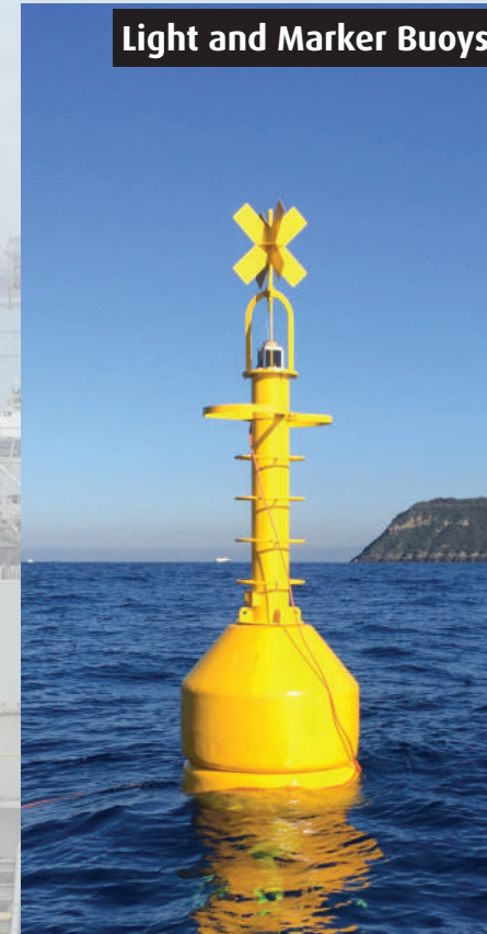
Light and Marker Buoys